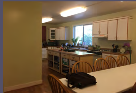
The kitchen got a new coat of paint and is much lighter and brighter!

To show off our changes, we are having an Open House/Welcome Back! on Wednesday, September 14 from 1-3 pm . Come and check things out, and enjoy some lemonade and cookies as we head into the new term!