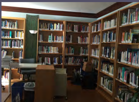
Our new library space, almost complete!

The library is settling into its cozy new space. We've moved in all essential books, DVDs, and journals, as well as the student computers and copy machine. Less frequently accessed books and journals remain available by request. And we are extending the library hours, opening 30 minutes before classes begin each week day. Starting with fall term, the library will be open from 8:30 am to 6 pm Monday through Thursday, and 8:30am to 4 pm on Fridays.