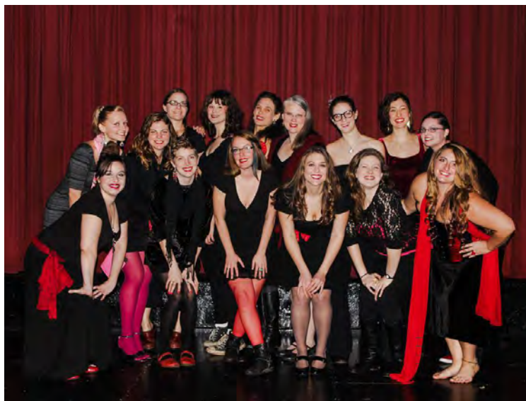
The Vagina Monologue Cast!