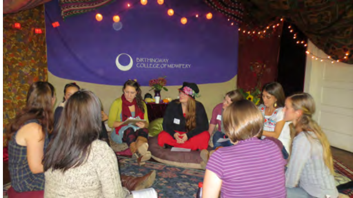
Birthingway midwifery students chatting with applicants during an admissions event, Meet & Greet.

Birthingway's admissions process reflects our core values and beliefs as described in our Student Handbook and Catalog, especially those of relationship and multi-vocality.