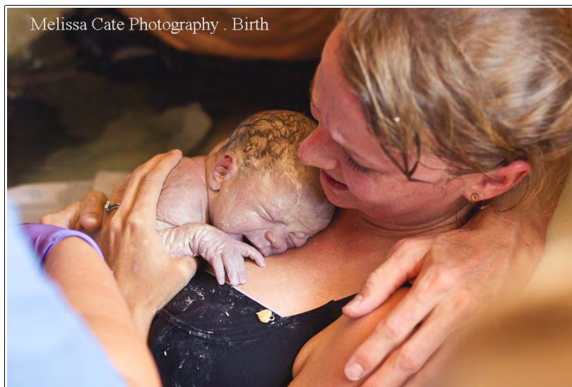
Birth Photography from Trillium Waterbirth Center